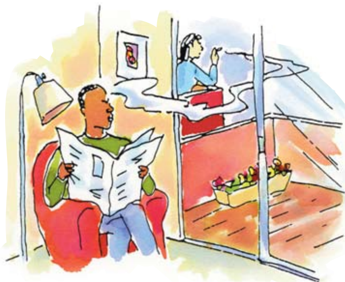
Illustrations by Janet Cleland

As a general rule, it is unwise to file a lawsuit unless you have suffered significant harm. Your chance of convincing a court that you have a justifiable legal claim is far better if you can show that you have been harmed badly by repeated, unwanted exposure to secondhand smoke in your apartment—for instance, if you have visited a doctor with frequent respiratory complaints, missed work due to illness caused by the smoke, stayed away from